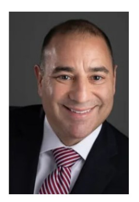
We are grateful to the tireless advocates who raised their voices and their stories with pas-

New Yorkers with I/DD needed meaningful investment to sustain quality supports and care. Our staff needed meaningful investment to align their compensation with their skill and dedication. We called for an 8.5% COLA and a Direct Support Wage Enhancement to meet those needs. The legislature included an 8.5% COLA and no DSWE in their budgets. We advocated fiercely for that compromise to be realized, but the end result is entirely inadequate.