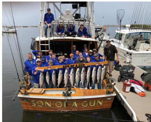
Everyone had a great time on the water.

The tournament included 5 charter boats from K & G Lodge in Pulaski, and prizes were awarded in different categories.