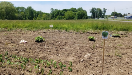
The garden includes peppers and beans.

Our LIFE program planted a vegetable garden for the second year in a row! The garden is still located on Owens Road in Fulton, where Sunoco is allowing us to use land. Rhiannon and other individuals have planted corn, beans, peppers, spaghetti squash and more. The plants are all growing wonderfully.