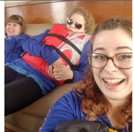
These ladies took a break from fishing to simply enjoy relaxing on a boat.