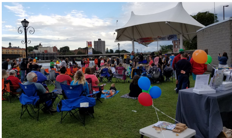
We had a wonderful day and a great crowd for this year's festivities!