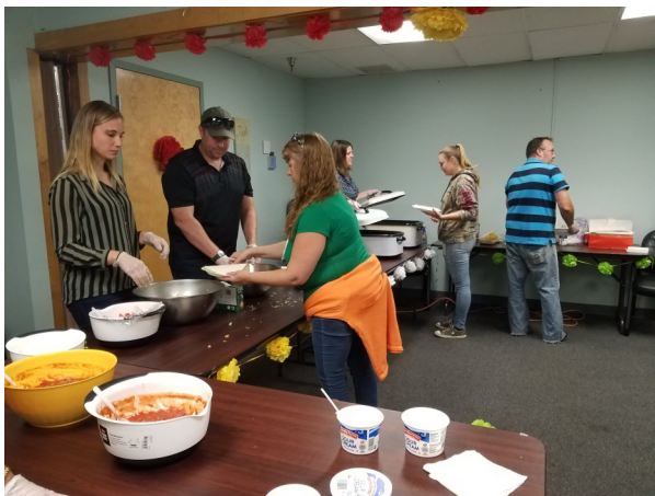
Left: Supervisors and support staff served tacos to DSP staff on Taco Tuesday.

The week of Sept. 9-13, Oswego Industries celebrated the agency's heroes, the DSPs. Festivities included Taco Tuesday, mini massages for the DSPs, an ice cream sundae bar, fun prizes, and more!