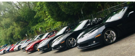
The Corvette Club also brought their rides to the OI/The Arc picnic!

Make sure you go outside and check out the pavilion!