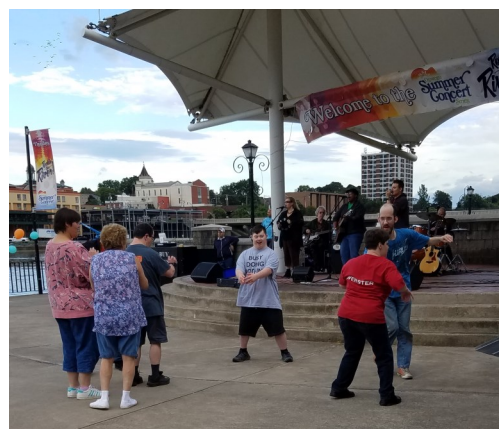
There was plenty of dancing.

On September 6, The Arc of Oswego County held their annual membership picnic at West Linear Park in Oswego. FLAME the Band performed live, with fun classic tunes and a few new favorites.