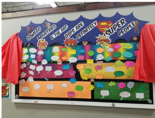
Right: We recognized all of the amazing work our DSPs do every day with a praise board outside of the café.